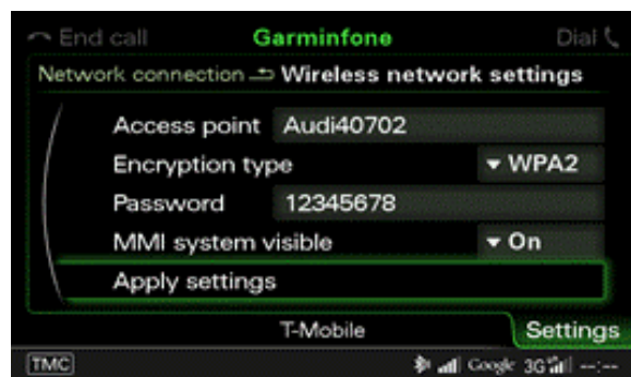
Figure 5. Wireless network settings.

6. As part of the update, wireless settings and paired devices will be deleted. All devices will need to be re-paired after the update, and all wireless settings restored to the customer's settings. To access the Wireless network settings on the MMI (Figure 5), press TEL >> Settings >> Wireless network connection >> Wireless network settings . Record all settings so they can be re-entered at the end of the update.