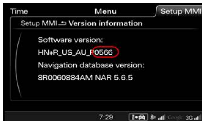
Figure 1. MMI software version (566).

Tip: The MMI software version can be found under Menu >> Setup MMI >> Version Information (Figure 1).