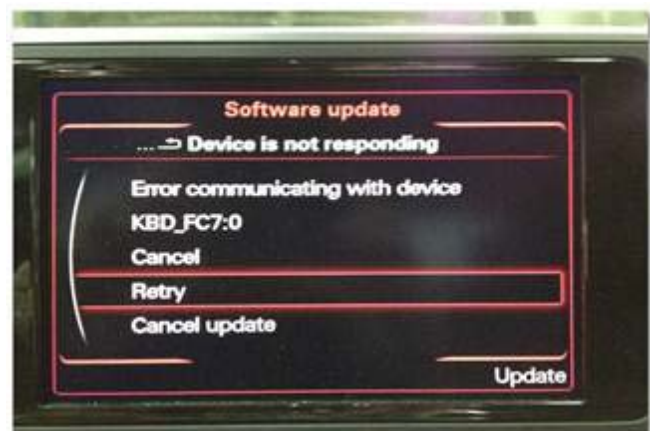
Figure 6. A device requiring a 'Cancel' selection.

Some earlier model year 2012 vehicles, or vehicles equipped with Bose® sound systems may experience certain modules that will not update properly during Step 16 of TSB 2028141. If this should occur, either choose 'Cancel' (Figure 6), or 'Skip device' (Figure 7), depending on the type of error. Do not choose 'Cancel update', as this may cause the software update to fail entirely. After the update is finished and the summary page is shown, select 'Retry' at the bottom of the list if it is available to attempt to update the modules again. If 'Retry' is greyed out, then the software update was successful. Select 'Continue' to proceed. In some cases 'Retry' may have to be repeated two or three times to get all modules to update successfully.