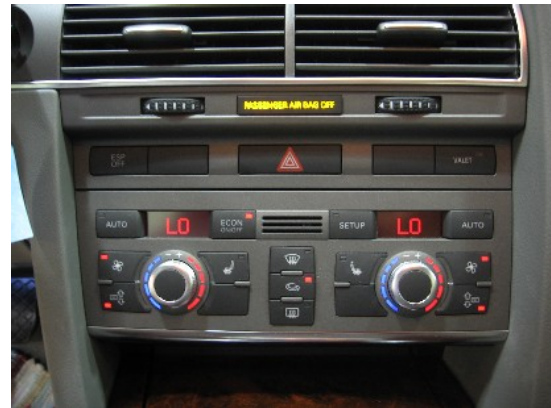
Figure 1. Climate control settings.