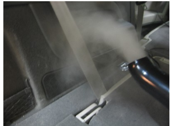
Figure 5. Correct positioning of the outlet tube on a Q7.