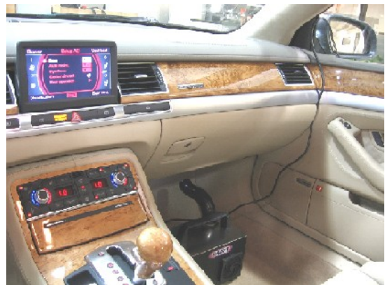
Figure 4. Window is slightly open so that the cord can pass through.