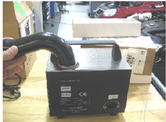
Figure 3. The connected outlet tube.