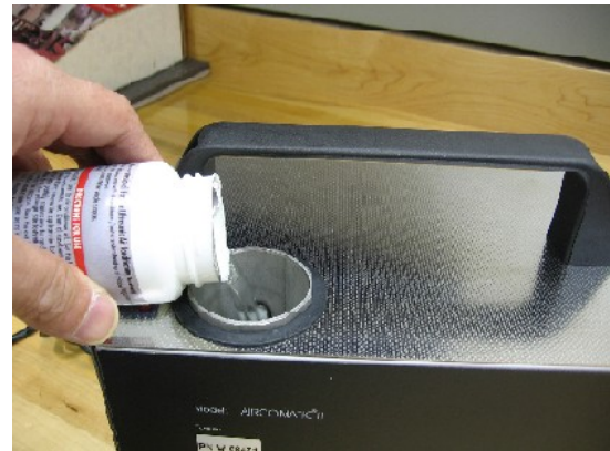
Figure 2. Pouring the treatment into the filling chamber.