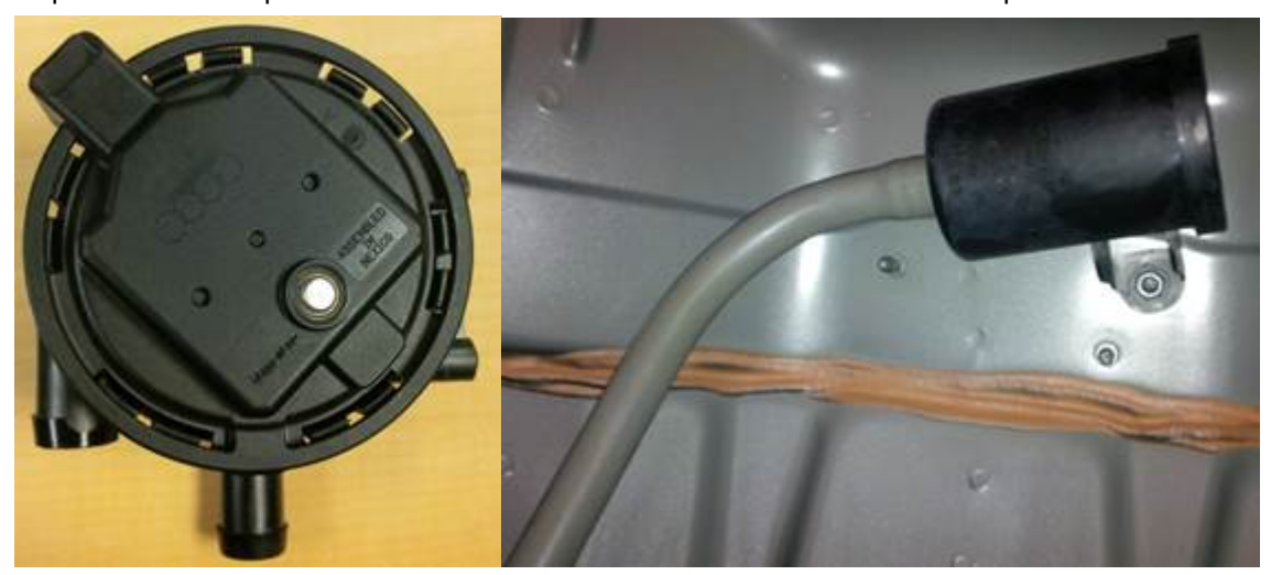
Figure 1. NVLD pressure sensor (left) and NVLD filter (right).