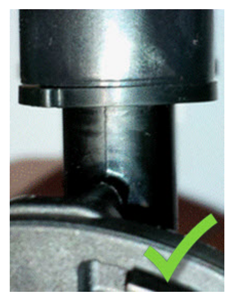
Figure 6. Correctly-installed sensor and grommet.

When the sensor and grommet have been correctly installed, the grommet and canister will be flush (Figure 6). At this point, the vinyl tape can be removed (or it can be left in place).