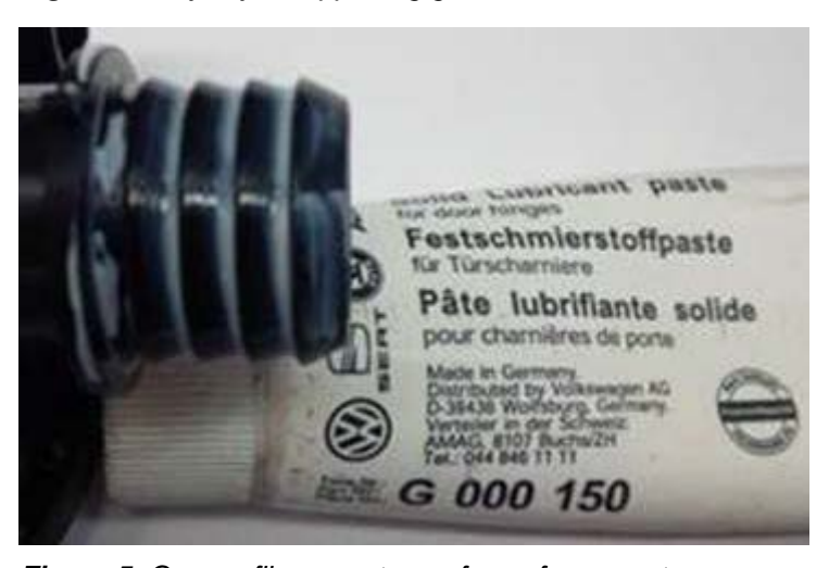
Figure 5. Grease film on outer surface of grommet.

Apply a small amount of grease to create a film on the outer surface of the grommet before installing the sensor (Figure 5).