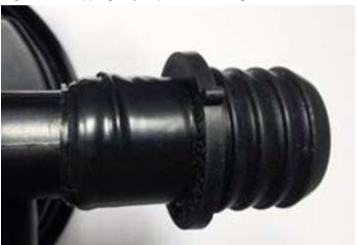
Figure 4. Vinyl layer supporting grommet.

Apply a small amount of grease to create a film on the outer surface of the grommet before installing the sensor (Figure 5).