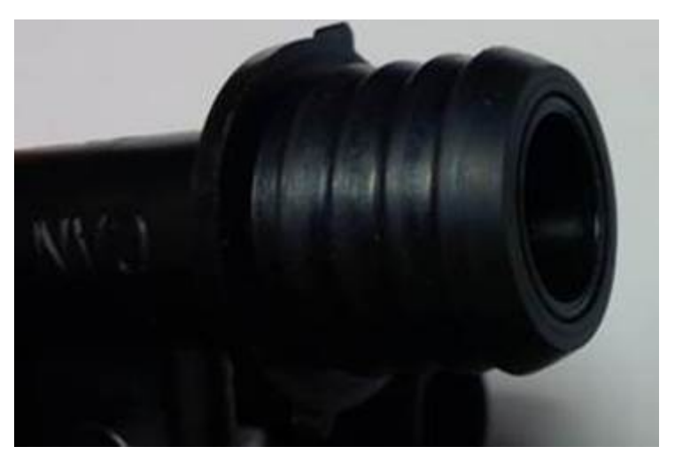
Figure 2. Align grommet and sensor outer edges.

Align grommet and sensor outer edges (Figure 2).