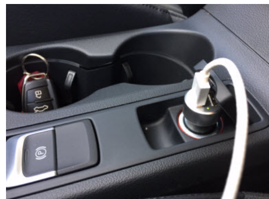
Figure 2. Accessory device connected to the 12V power socket.

The condition may happen more frequently with certain accessory devices. Accessory devices with lower power or current ratings may be less likely to cause the condition than devices with higher power or current ratings (Figure 3).