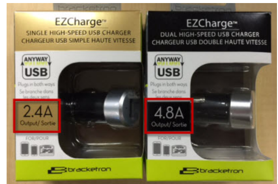
Figure 3. Example of a charger with a lower power rating of 2.4A (left) and a charger with a higher power rating of 4.8A (right).