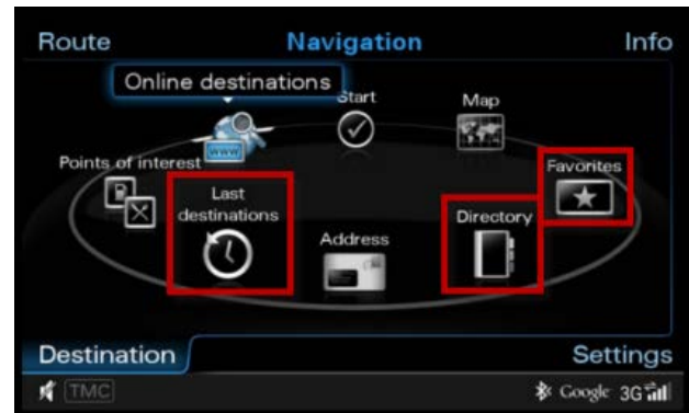
Figure 1. Navigation >> Favorites, Navigation >> Directory, and Navigation >> Last destinations submenus