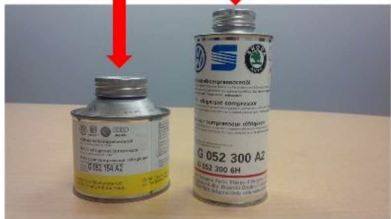
Figure 3: Compressor manufacturer specific PAG oils.