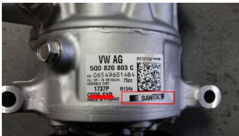
Figure 1: Sanden compressor identification tag.

The originally installed compressor on the MY 2015 A3 is manufactured by Sanden (Figure 1). The replacement compressor is manufactured by Denso (Figure 2).