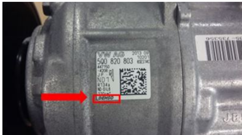
Figure 2: Denso compressor identification tag.

When replacing the original Sanden compressor with a Denso compressor, be aware that while the refrigerant volume is the same regardless of the compressor installed, the PAG oil type and volume is not. Sanden and Denso compressors have specific PAG oils that must be used. The original PAG oil that will be in the refrigerant circuit must be flushed out completely with the air conditioning service station with flushing equipment, as specified in the Elsa Repair Manual.