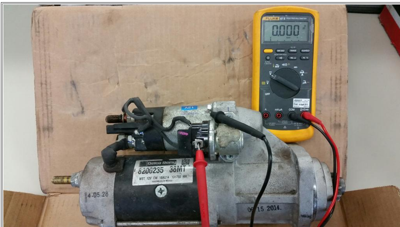
Figure 1: Starter IMS S terminal DVOM Hookup Location