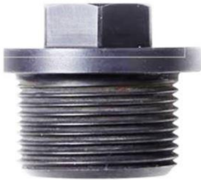
Figure 2: Plug

8. Install Plug supplied in 04-202-01 Air Compressor Lift Tool into discharge port. (refer to figure 2 and 3)