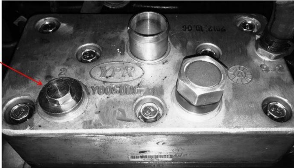
Figure 3: Discharge Port