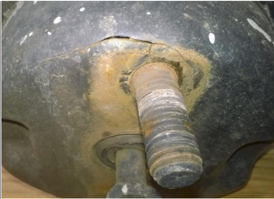
Figure #1: Fractured Chamber