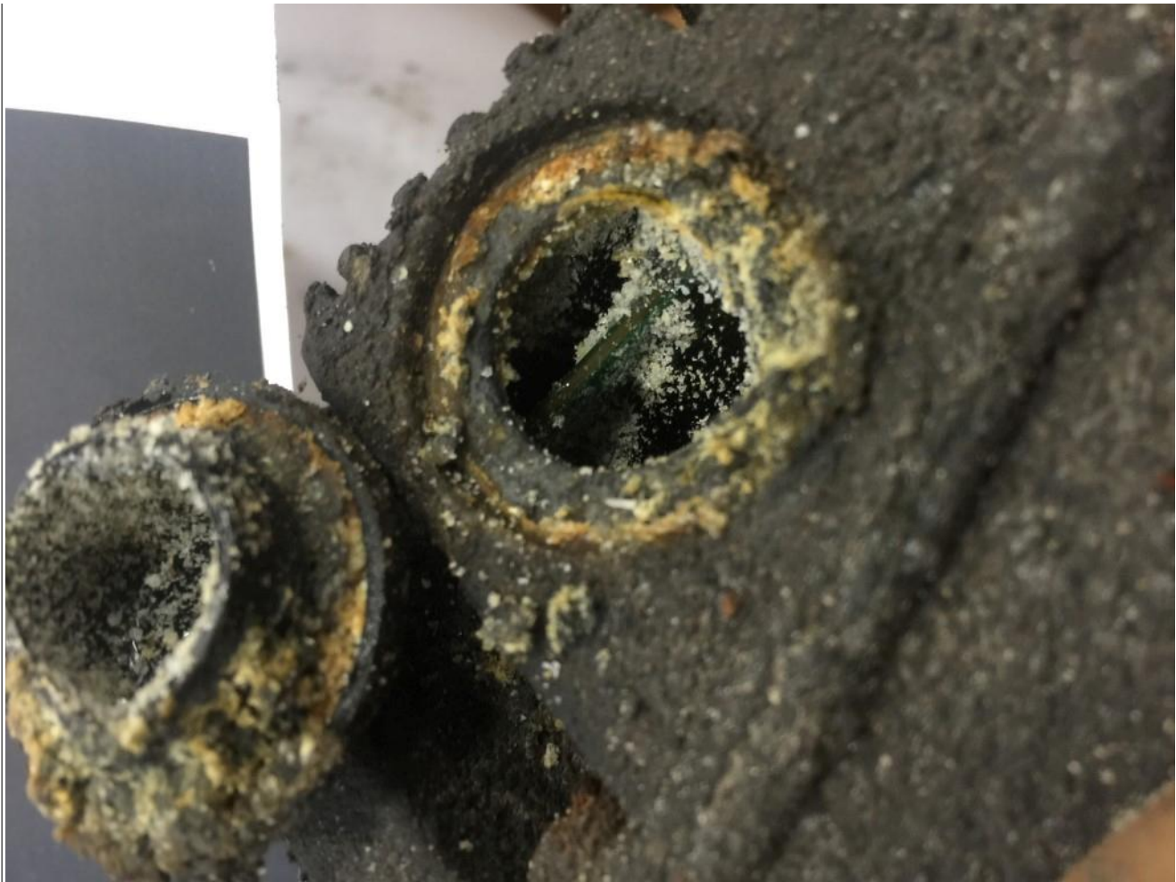
Figure 3: Same RPM as from Figure 2. The plug has been removed only for demonstrational purposes. Notice how debris has entered housing. This RPM should be replaced.