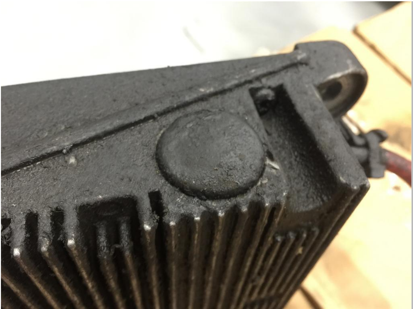
Figure 1: RPM is covered in debris, but there are no signs of infiltration under the rubber plug (plug is still seated on the housing, no signs of debris pushing the plug upwards). This RPM should not be replaced.