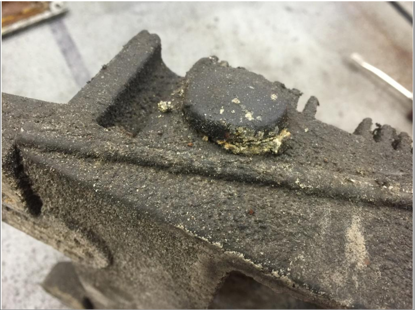
Figure 2: The plug is being pushed upward by debris and it is clear that debris has begun to enter inside of the housing. This RPM should be replaced.