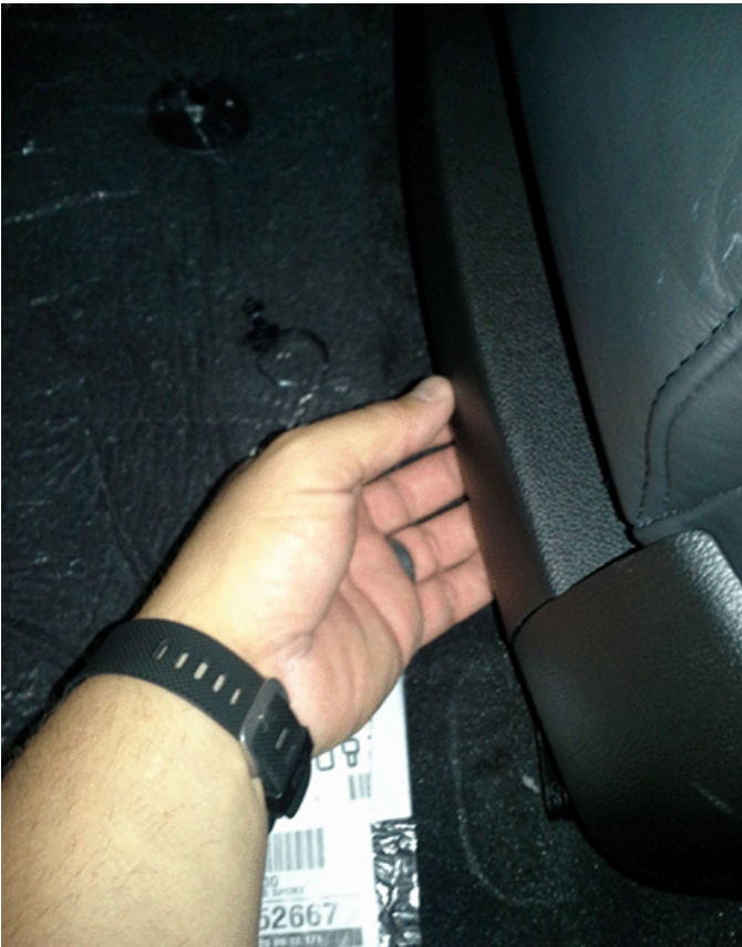
b. Pull the Inboard nose cover straight out (toward brake pedal)