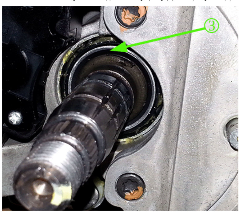
1.4 Using a magnet, remove the upper bearing inner race (3) from the column. Do NOT remove the upper bearing.