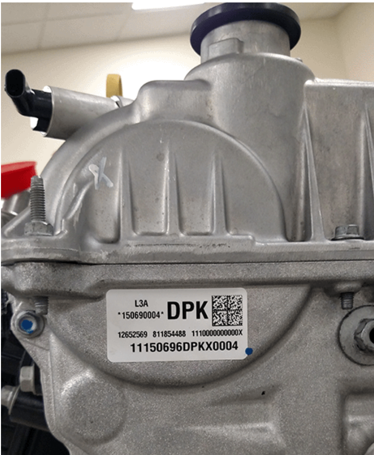
Engine Block Below Intake Manifold