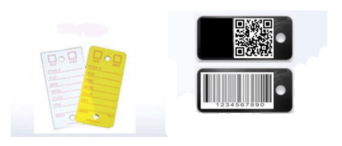
Lightweight small poly key tags

The following are examples of acceptable key tags: