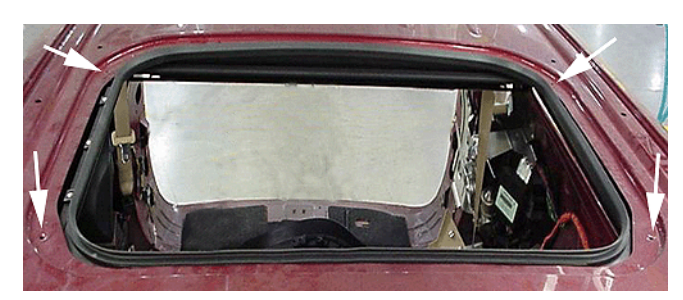
Important: The sunroof fixed rear panel glass has been removed for illustration purposes.

1. Lower the headliner following the procedure in SI.