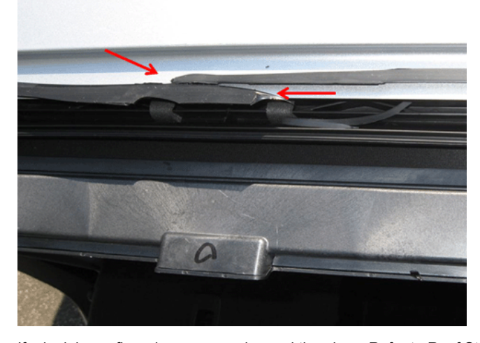
If a leak is confirmed, remove and reseal the glass. Refer to Roof Stationary Window Replacement in SI.