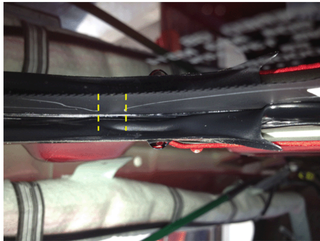
The graphic below shows an example of a leak caused by the urethane not being properly aligned.