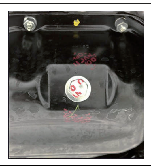
Figure 2. Indication of Inspection Label Removal

4. Complete Section A of the "Engine Oil Consumption Test" at the end of this bulletin.