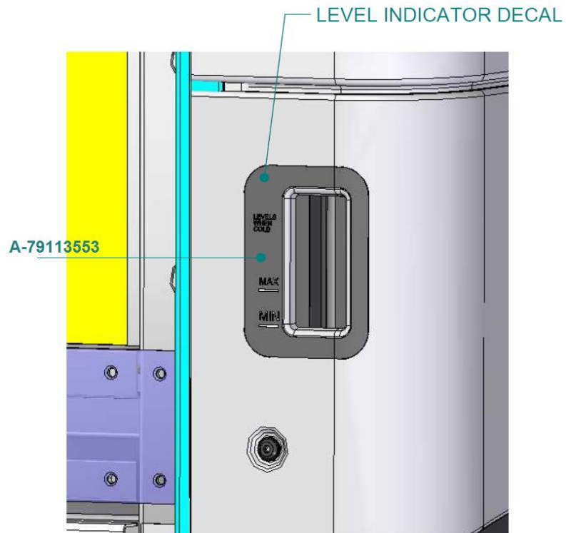
Figure 3: New level indicator decal installed.