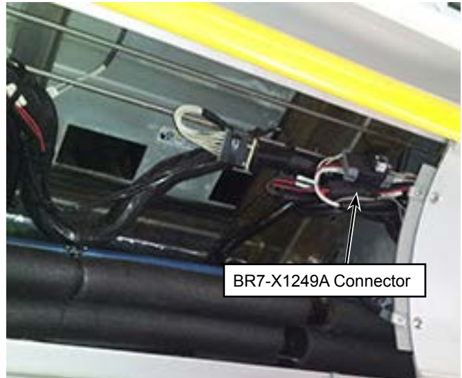
Figure 3 - BL9-X0205A and BR7-X1249A Connector Location