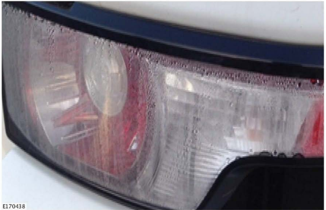
8. A thick mist covering the lens with water droplets.