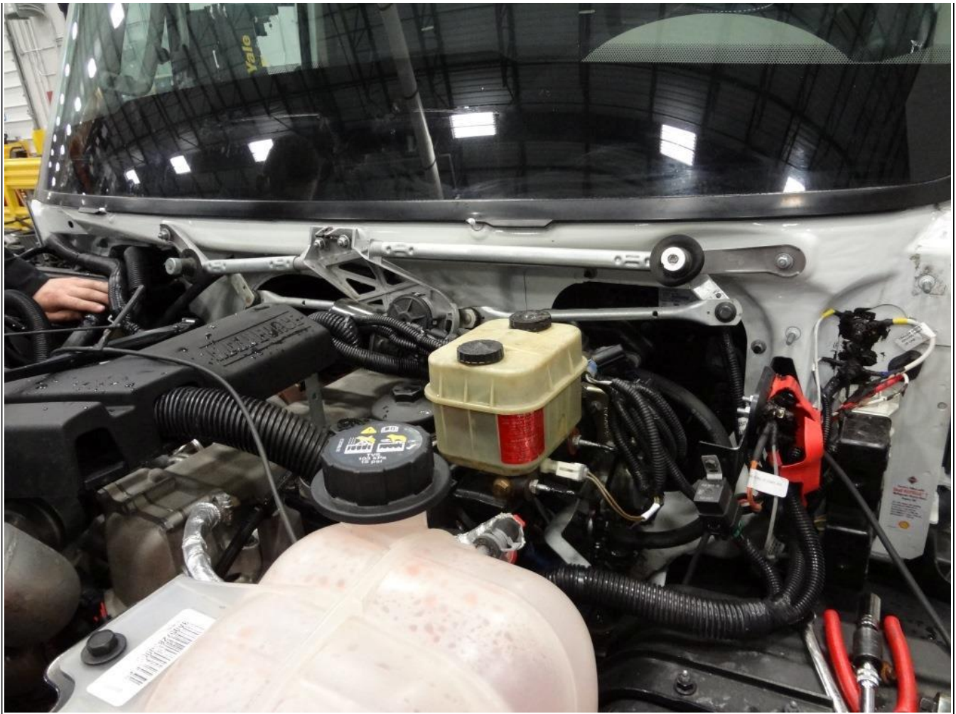
Cowl tray removed, no seal installed.