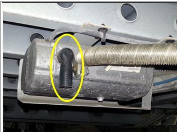
Figure 1: Hydronic Air Induction Pipe