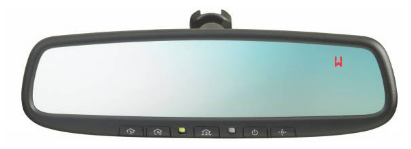
Auto-Dimming Compass Mirror with HomeLink

For mirror installation, remove the OE mirror by first disconnecting the wire harness from the back of the mirror. Loosen the Torx® screw then slide the mirror upward and off of the windshield mirror mount.