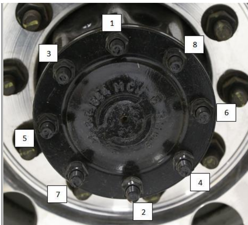
Figure 2 (Torque Sequence)