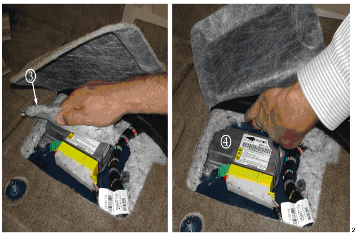
Seat removed for illustration purposes only