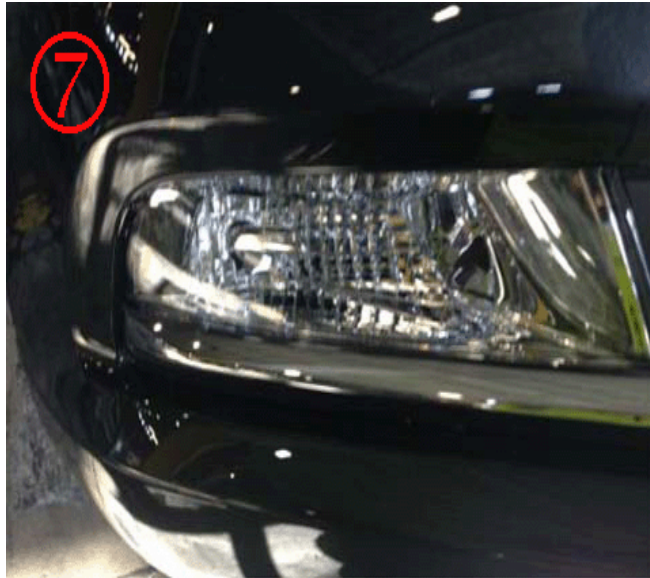
Daytime Running Light (base)