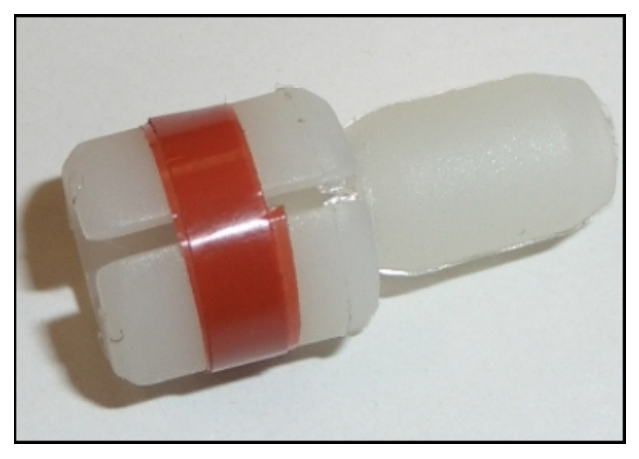
Figure 2 (Adhesive strip shown in red for clarity)

• Measure the diameter of the new plug with the adhesive strip. The diameter must be approximately 13.4 mm (see Fig. 3).