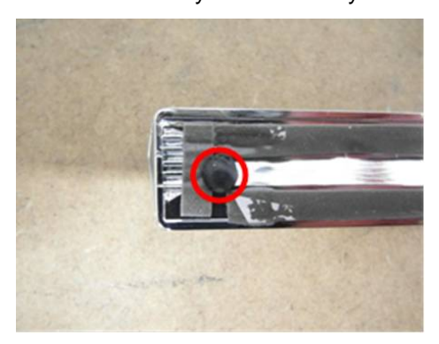
Figure 5 (rear trim strip area)

• Form two balls of butyl sealing cord (part number: AKL 450 005 05) per trim strip with a diameter of 4-5 mm. Attach the butyl balls centrally in the end areas of the trim strip from the inside (Figures 5 and 6).