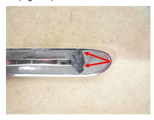
Figure 7 (front trim strip area)

• The open areas of the adhesive tape must be closed by pressing the butyl balls into the gaps of the tape (Figure 7).