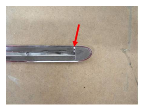
Figure 4 (front end of a trim strip)

• Form two balls of butyl sealing cord (part number: AKL 450 005 05) per trim strip with a diameter of 4-5 mm. Attach the butyl balls centrally in the end areas of the trim strip from the inside (Figures 5 and 6).