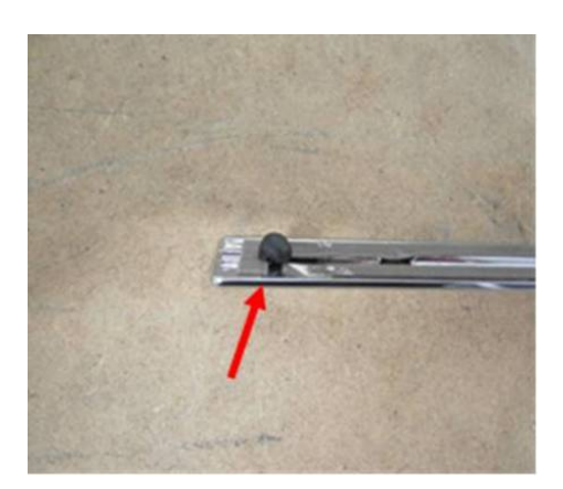
Figure 6 (rear trim strip area)

• The open areas of the adhesive tape must be closed by pressing the butyl balls into the gaps of the tape (Figure 7).