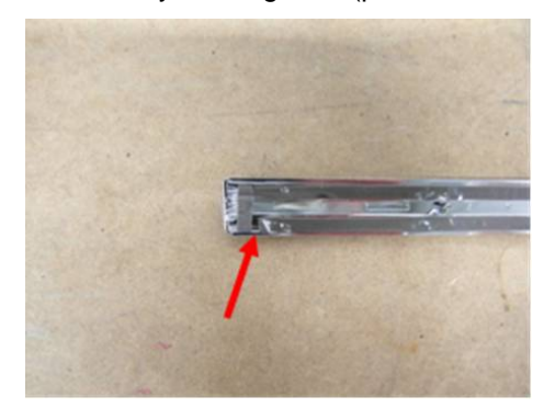
Figure 3 (rear end of a trim strip)

To avoid repeated water ingress, close the open areas on the trim strips in the end points of the adhesive tape with butyl sealing cord (part number AKL 450 005 05 - Figure 3 and 4, red arrows).