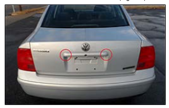
Figure 1 (rear lid handle)

Corrosion where handle contacts rear lid (Figure 1).