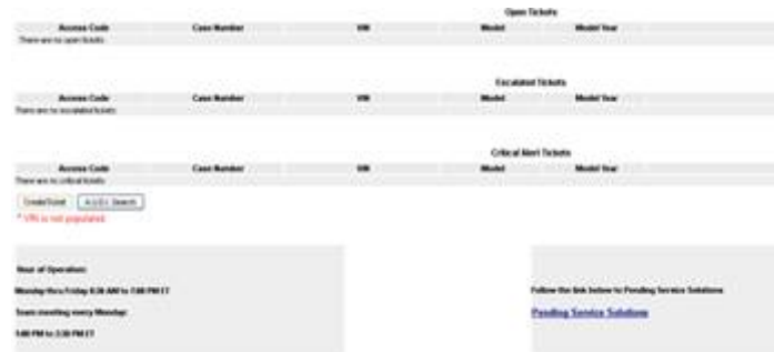
Figure 2. Technical Assistance page