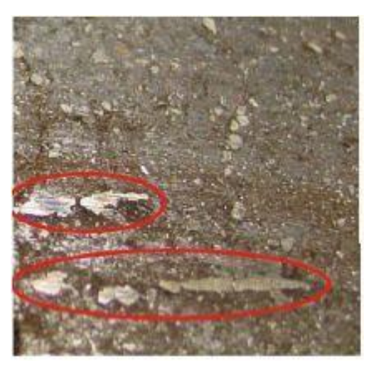
Figure 1. Metallic deposits.