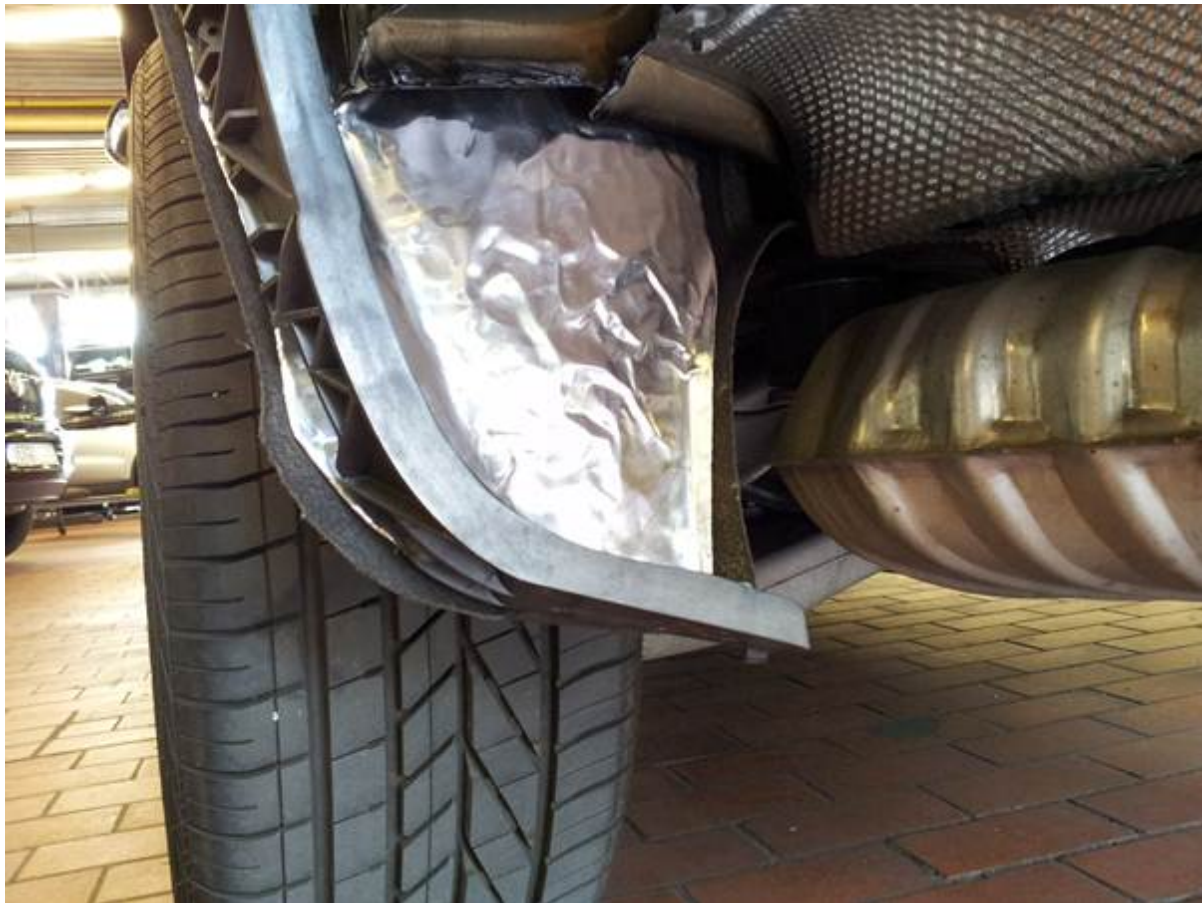
Figure 3. Foil kit installation.