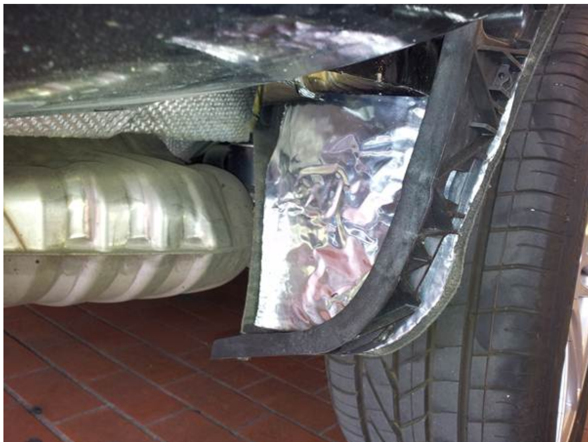
Figure 4. Foil kit installation.