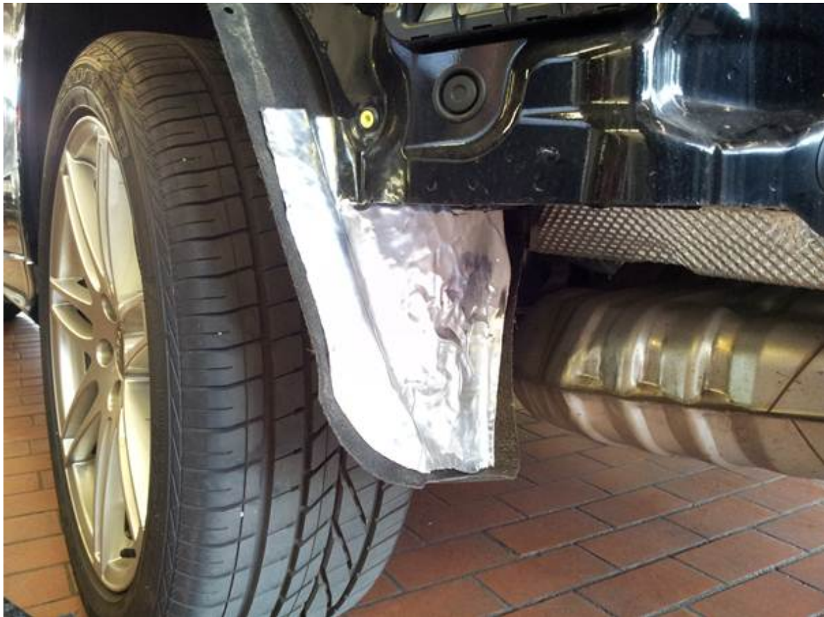
Figure 1. Foil kit installation.