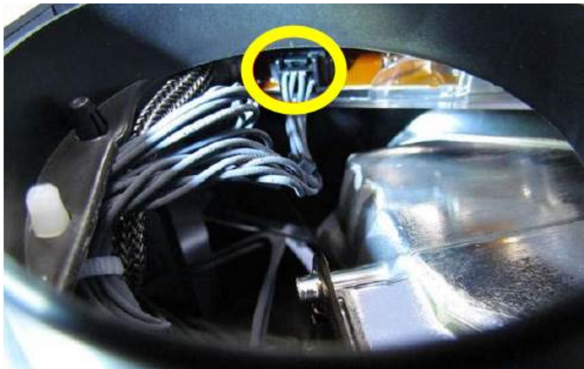
Figure 3. Check these connectors.