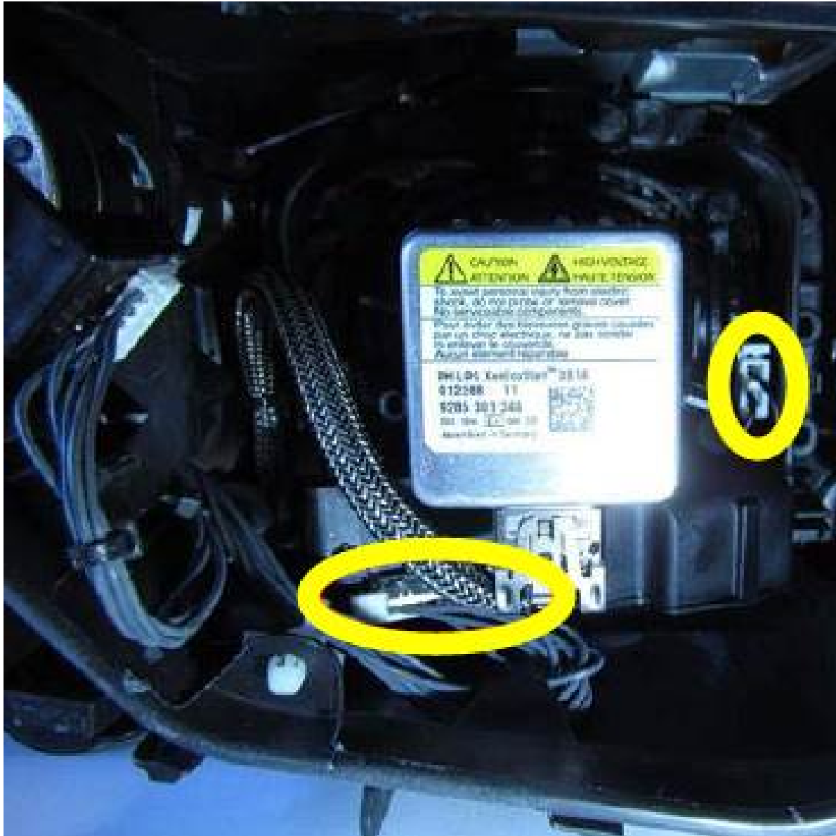
Figure 2. Check these connectors.