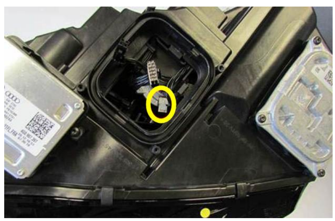
Figure 3. Check this connector on vehicles with PR codes 8EX and 8EY.