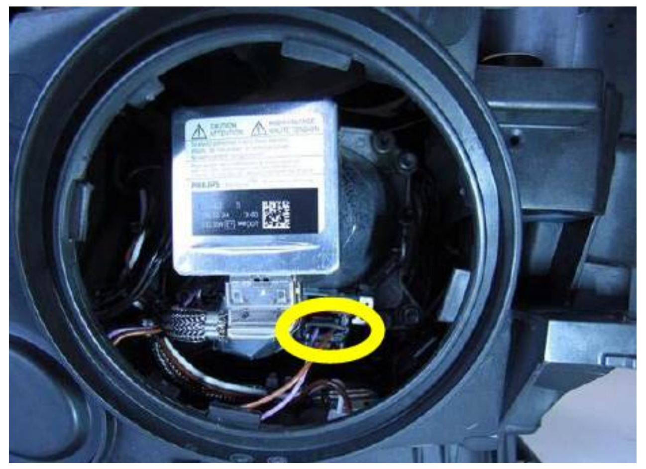
Figure 2. Check this connector on vehicles with PR code 8Q3.