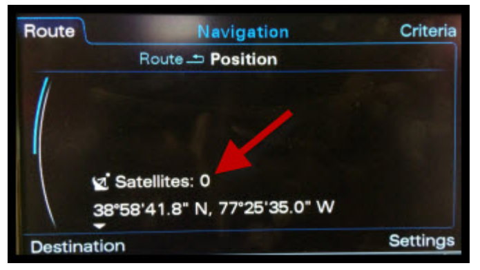
Figure 2. Number of satellites received.

To view the number of satellites being received, go to Nav >> Route >> Current Position (first item in list) >> Scroll up (Figure 2). If the system does not receive any satellites during this timeframe, submit a Technical Assistance Center ticket.