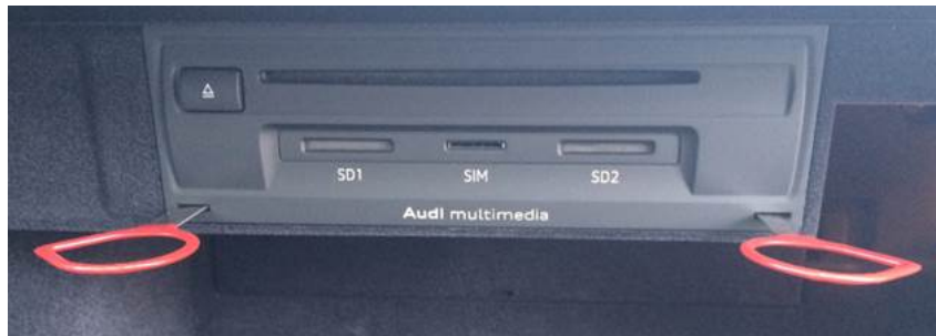
Figure 2. Remove the J794 module.