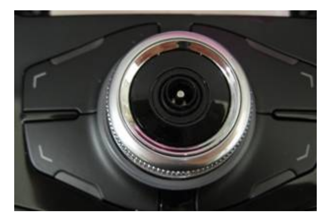
Figure 3. Control knob with rubber boot.