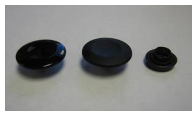
Figure 2. Contents of the 8K0998068 repair kit.

Obtain repair kit 8K0998068. The kit contains three pieces: gloss finish joystick, matte finish joystick, and rubber boot (Figure 2).