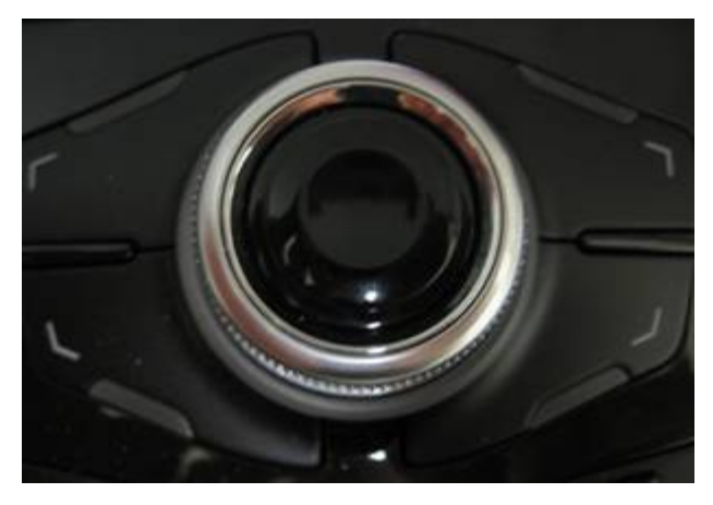
Figure 4. Control knob with joystick installed.

3. Install the appropriate joystick (Figure 4).