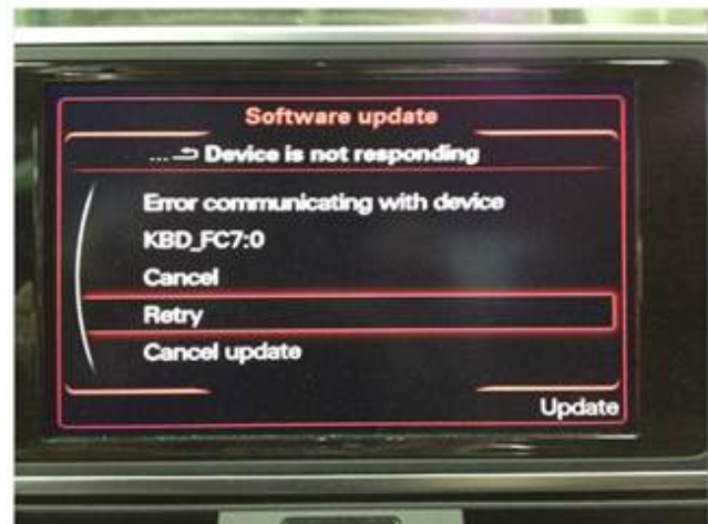
Figure 3. A device requiring a 'Cancel' selection.

After the update is finished and the summary page is shown, select 'Retry' at the bottom of the list (if it is available) to attempt to update the modules again. If 'Retry' is greyed out, then the software update was successful; select 'Continue' to proceed. In some cases, 'Retry' may need to be repeated two or three times to get all modules to update successfully.