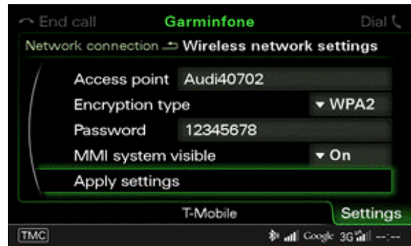
Figure 2. Wireless network settings.