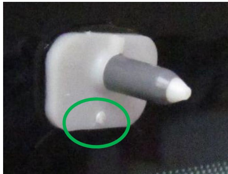
Figure 2. Centering pin with lug removed.