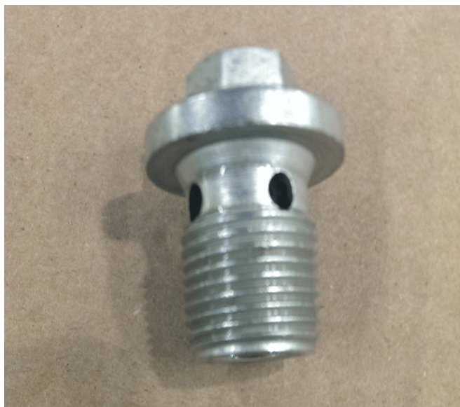
View of engine oil pan drain plug on workbench with gasket missing.