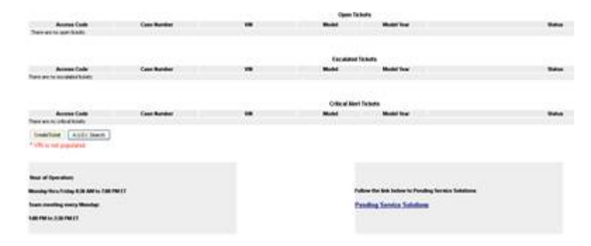
Figure 2. Technical Assistance page