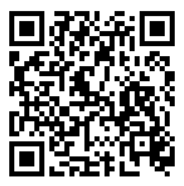
Figure 4. QR code for viewing the video with a QR code reader on phones and tablets. Alternatively, the video can be accessed through computer internet browsers at the link provided in this bulletin.

(Figure 4). See TSB 2039206 for more information about viewing videos.