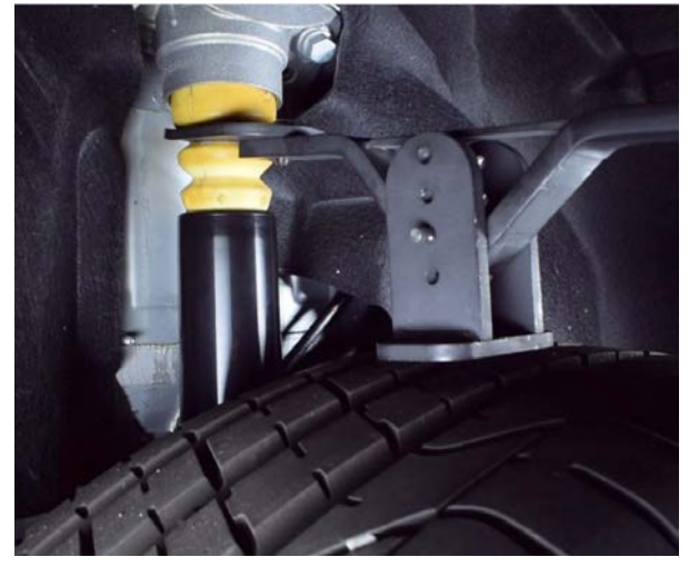
Figure 2. The SET900 tool being used to install a rear bump stop.