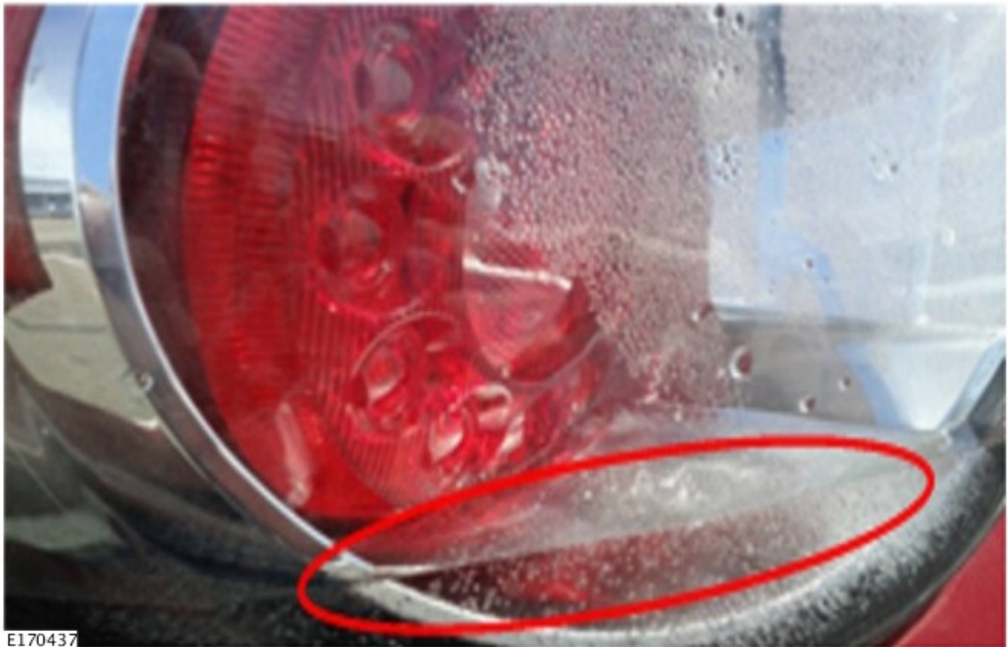
7. Standing water within the lamp.