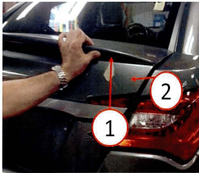
Fig. 1 Spoiler Inspection 1