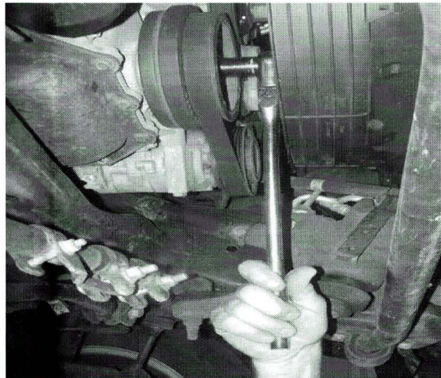
Fig. 1 Engine Rotation