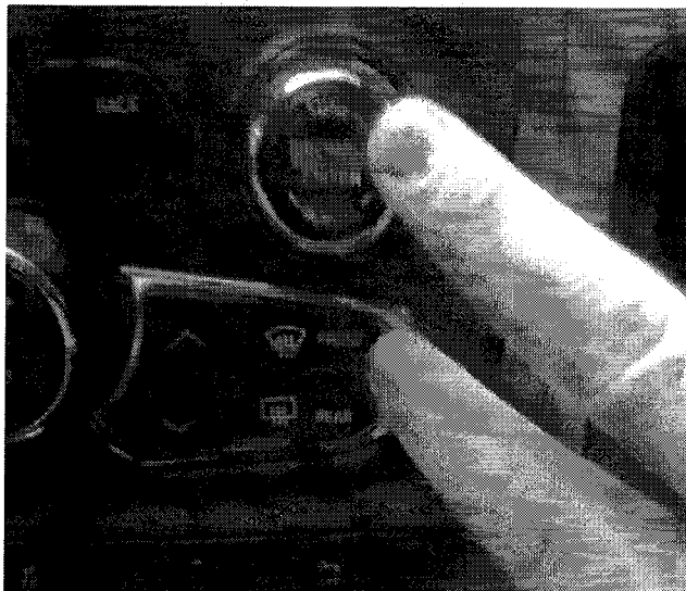
Fig. 2 Take Vehicle Out of Ship Mode