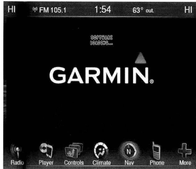
Fig. 8 Garmin software loading

CAUTION: Do not interrupt the software update process once it has begun. It may cause permanent damage to the radio which will require replacement.