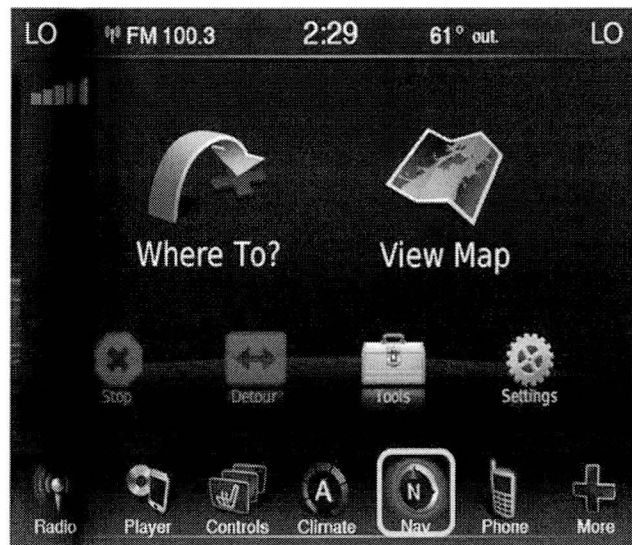
Fig. 9 Update Complete