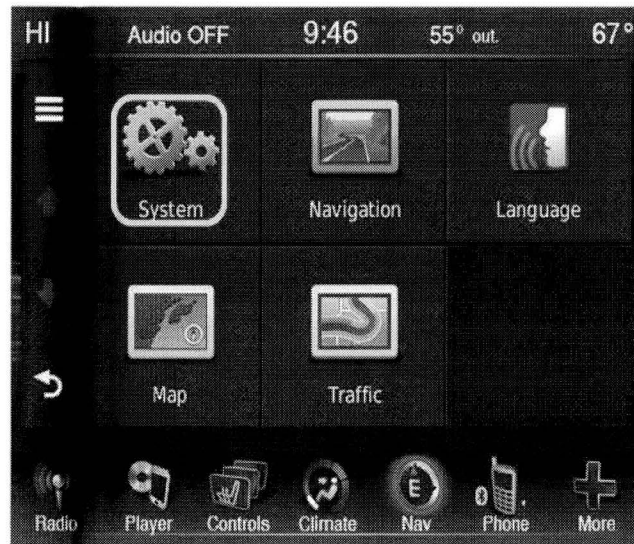
Fig. 4 System Icon

17. Press the About screen icon, see (Fig. 5), and record the software version.