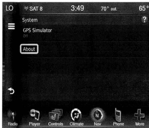
Fig. 5 About Icon

17. Press the About screen icon, see (Fig. 5), and record the software version.