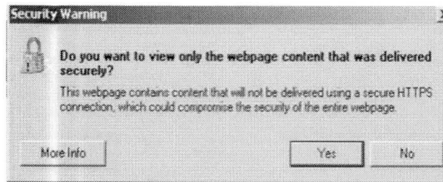
Fig. 2 Pop-up Security Message

NOTE: A Blank USB stick must be used to download the software. Only one software update can be used on one USB memory stick. One USB stick can be used to service multiple vehicles.