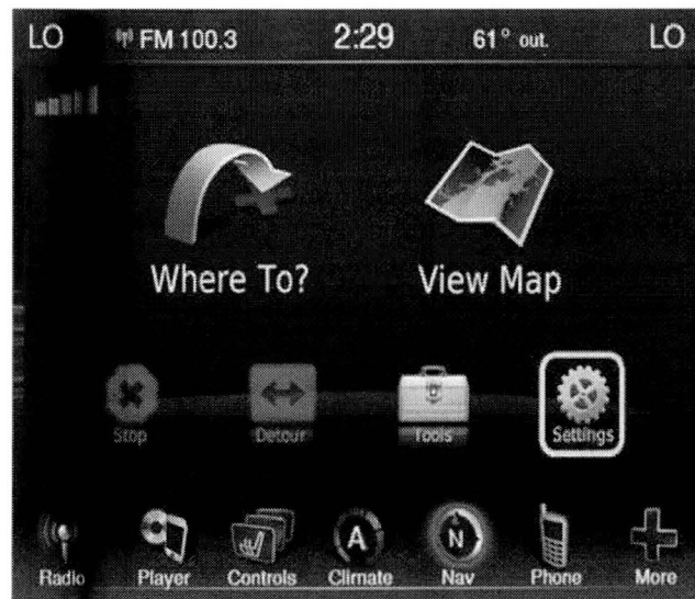
Fig. 3 Settings Icon