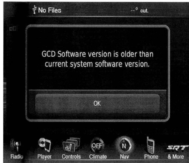
Fig. 6 Garmin Software Already Updated