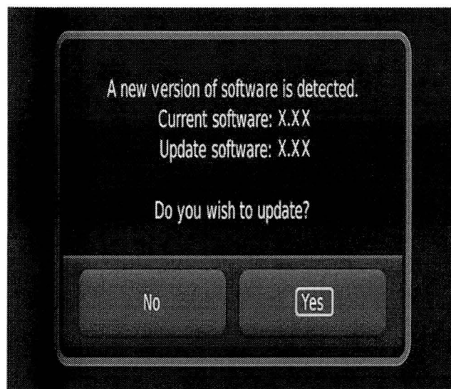
Fig. 7 Garmin Software Needs Updating