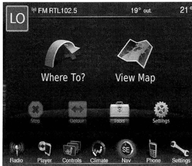
Fig. 5 Navigation Down Load Completed

15. When the software has completed down loading, the screen will change to the Garmin main screen, see (Fig. 5).