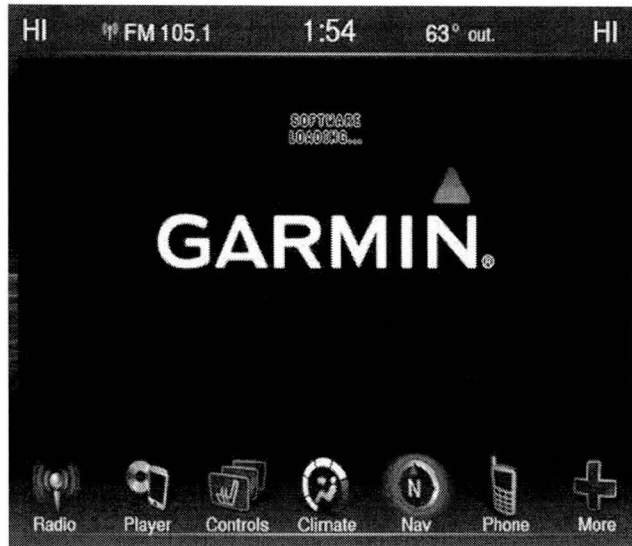
Fig. 4 This screen will be displayed next

14. This screen will be displayed when the update is being down loaded, see (Fig. 4).