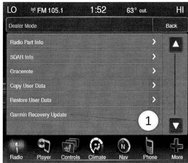
Fig. 1 Press Garmin Recovery Update to begin update