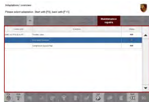
Kickdown threshold adaptation