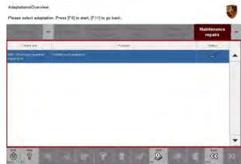
Throttle valve adaptation