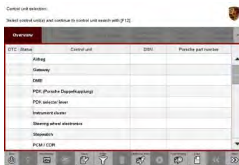
Control unit selection