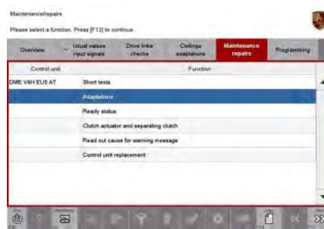
DME - Adaptations