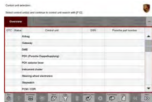
Control unit selection