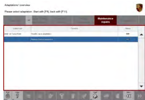
Radiator shutter adaptation