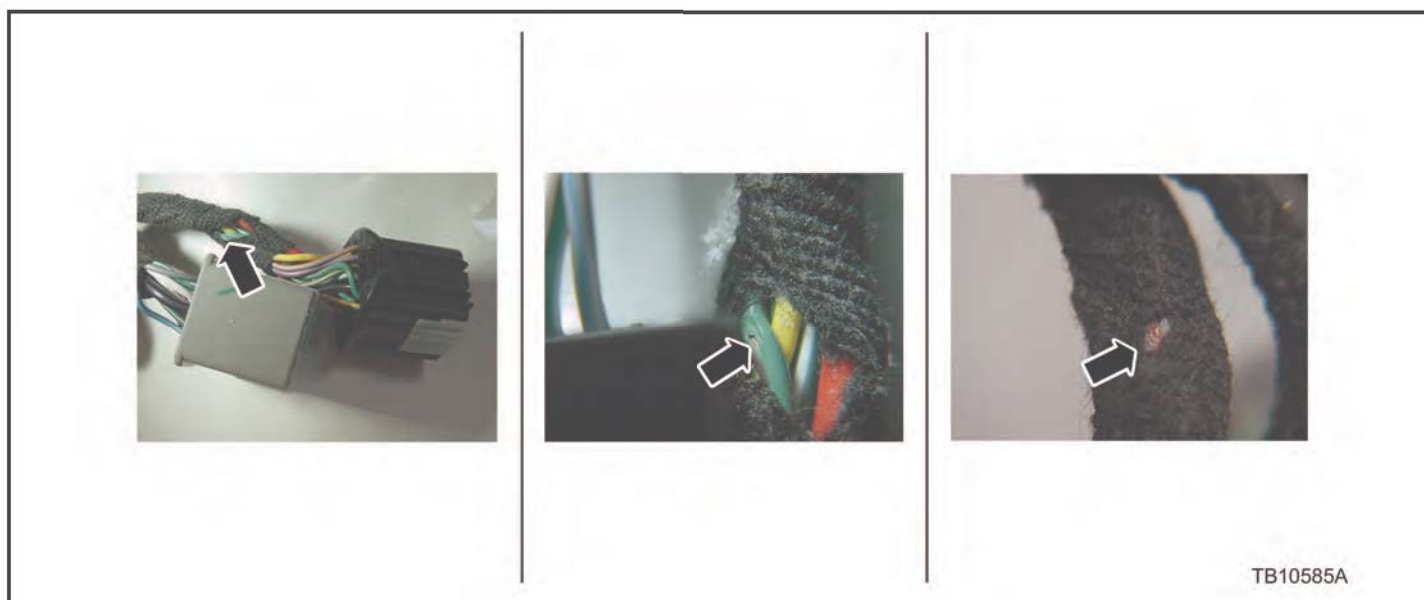
Figure 4 - Article 14-0155