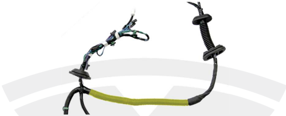
Figure 2 (Corrugated tubing highlighted)

⚠ CAUTION: Be careful not to damage the wires when removing the corrugated tubing.